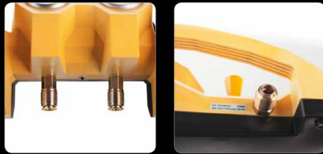
Protected inlet and outlet couplings, rubber feet