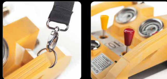
Sturdy, built-in handles and improved harness