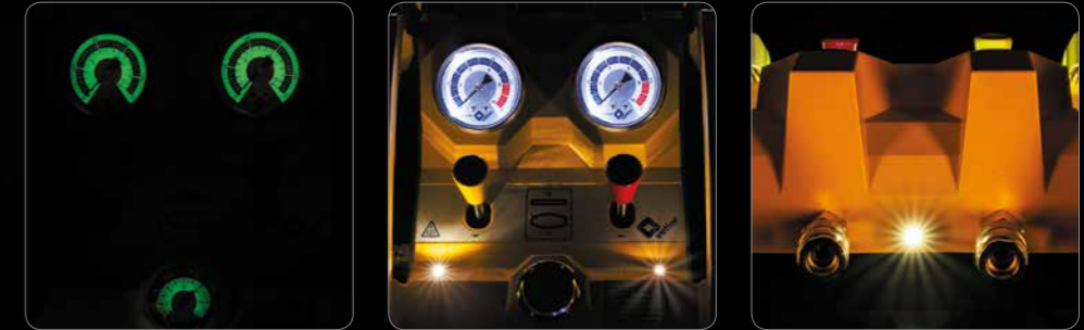
Glowing pressure gauges; optional: illuminated controls and pressure gauge, LED on the back