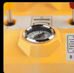
With inlet pressure gauge